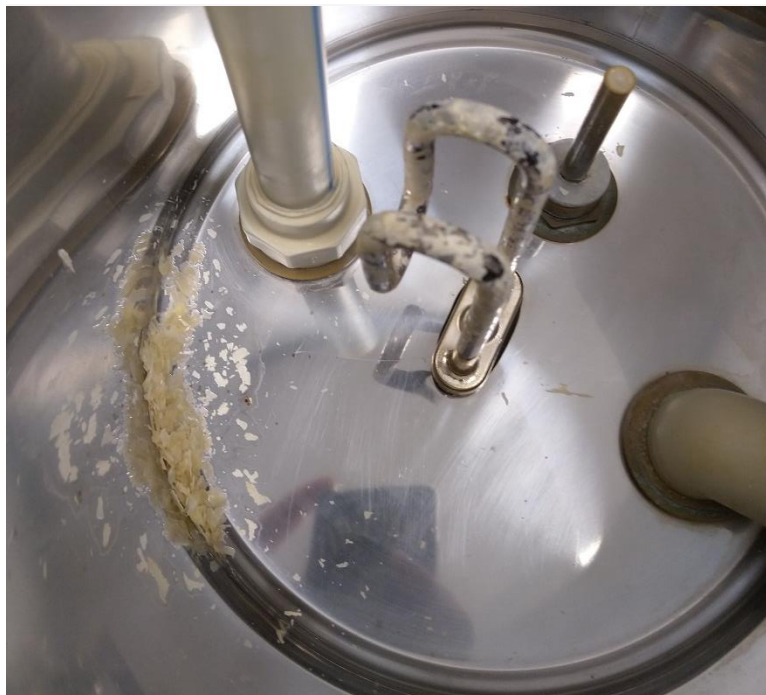
Pic. 1 The bottom of the first container (without treatment) with sediment.