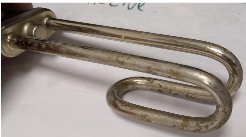
Pic. 5 Electrode from the 2nd container.