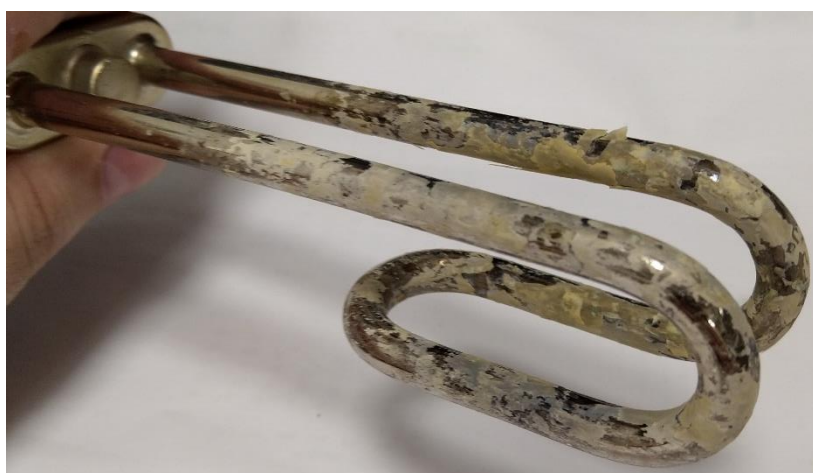
Pic. 2 The heating element from container 1 without water treatment.