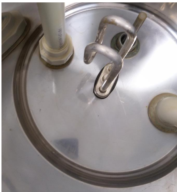
Pic. 4 View of the bottom of the container without deposits.