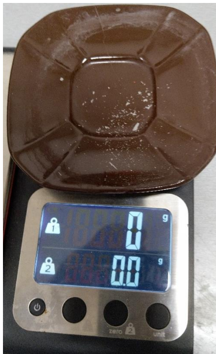
Pic. 6 Weight of the deposit from the electrode of the 2nd container.